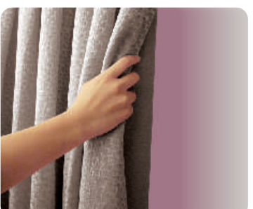
MANUAL OPERATION POSSIBLE WITHOUT DAMAGING THE DRAPERY