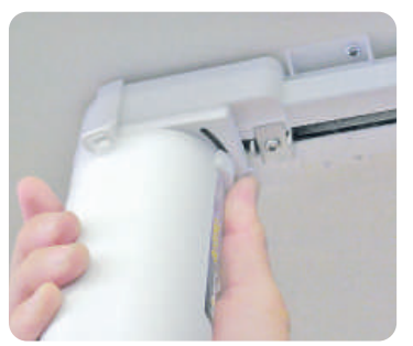
EFFORTLESS CLICK IN DESIGN