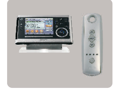
COMPATIBLE WITH A VARIETY OF CONTROLS